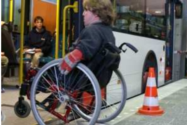
Figure 4: With some capers, people in wheelchairs succeeded in boarding the bus at a 12x3cm gap from the platform.