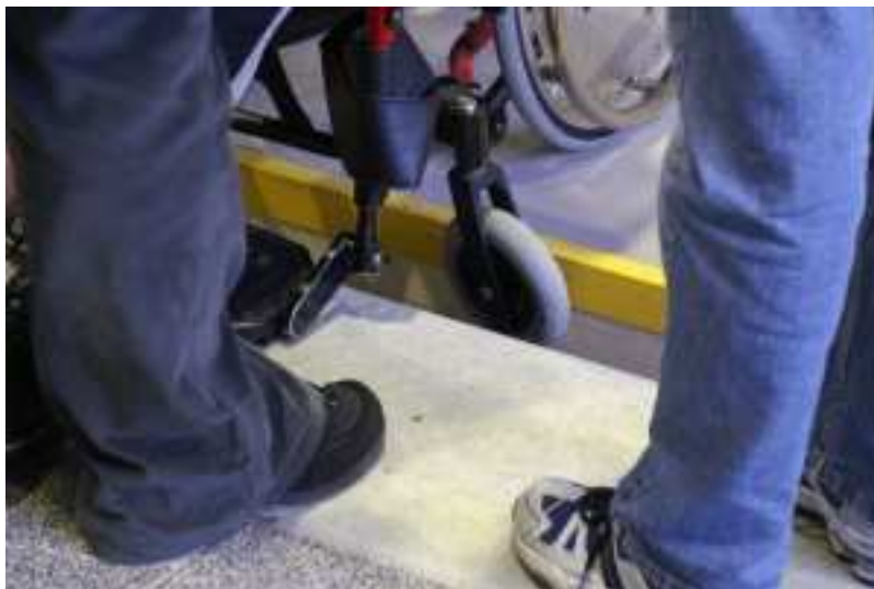
Figure 3: People got stuck in gaps...

The general attitude of the testing persons was such that the outcomes of the laboratory experiment should be regarded with some scepticism. In real life one may expect less.