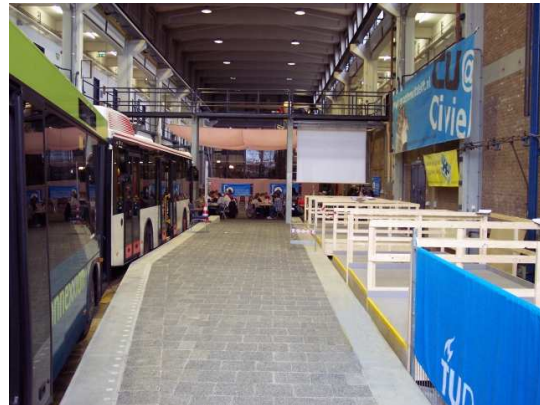
Figure 1: Overview of the laboratory set up from the ground floor.

In the TU Delft Transport Laboratory a testing site has been constructed. The city of The Hague provided the materials for copying a platform of its new Randstadrail (new light rail network) rail/bus stops. Overviews of the laboratory set up are shown in Figure 1 and Figure 2.