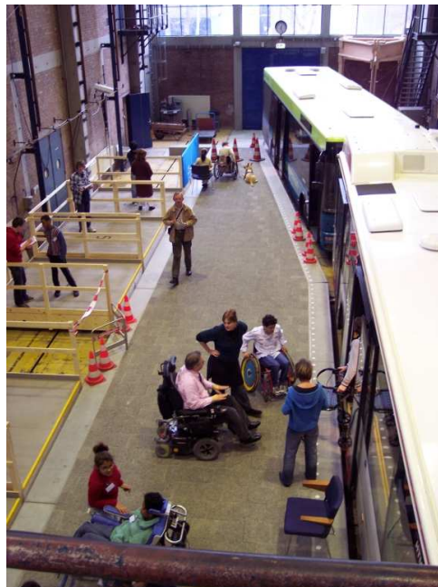
Figure 2: Overview of the laboratory set up from a higher point of view.

At one side of the platform, five wooden platforms have been erected at different combinations of horizontal and vertical distance, shown in Table 1. The closest platform, 2x2cm, represents the standard for Dutch elevators. The widest gap, 10x10cm, represents the acknowledged maximum value. A gap of 12x3cm gap was included,